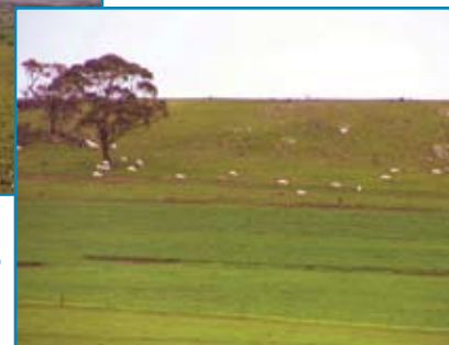
>> View of the proposed Robertstown Wind Farm site