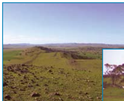
<< View of the proposed Stony Gap Wind Farm site

For the grid connections, Roaring 40s has commenced discussions with the network service company, ElectraNet, to identify the options for connecting the wind farms to the electricity grid. The outcome of this work, the proposed connection infrastructure, will form part of any Development Application submitted for the wind farms.